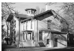
Tanner House Museum

The Aurora Area Retired Teachers' Association (AARTA) has been working for retired teachers in Kane County for over fifty years. Due to their continued interest in education, members of the AARTA created the Aurora Area Retired Teachers' Association Scholarship Fund to assist students attending a two-year college, or a professional, trade or vocational school. Eligibility is restricted to students who reside within the Community Foundation service area and within the boundaries of the following school districts: East Aurora 131, West Aurora 129, Kaneland 302, Batavia 101, Geneva 304 or St. Charles 303. The AARTA, which is the local unit of the Illinois Retired Teachers' Association, has over 400 members. In addition to providing this scholarship, members create and distribute lap blankets to residents of area care centers.