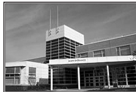
West Aurora High School

The West Aurora Class of 1958 Fund supports special programs and projects at the school. The current project is "commissioning" a bronze sculpture of the authentic Chief Blackhawk to be placed in the West Aurora High School Foyer. Chief Blackhawk has been the mascot of West High since 1936. Future projects will be determined by the Class of 1958 in consultation with school administrators.