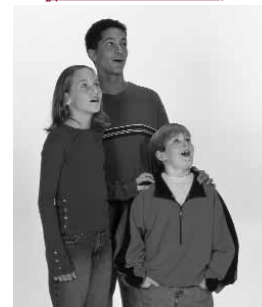
The Paramount Endowment makes wonderful things happen for children of all ages.

To ensure the continuation of this tradition in Aurora, the Paramount Arts Centre Endowment (PACE) is building a permanent fund to support the Paramount Arts Centre and the auditorium in North Island Center (Copley Theatre).